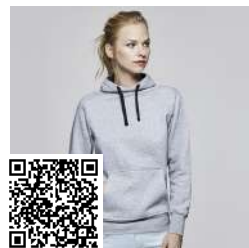
URBAN WOMAN SU1068