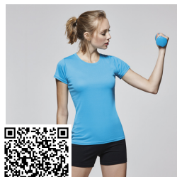
MONTECARLO WOMAN CA0423