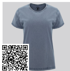
HUSKY WOMAN CA6691