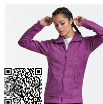
PIRINEO WOMAN CQ1091