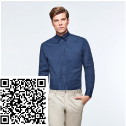
AIFOS L/S CM5504