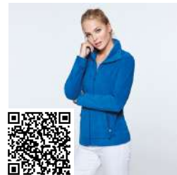
PIRINEO WOMAN CQ1091