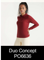
Duo Concept PO6636