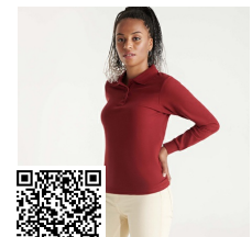
ESTRELLA WOMAN L/S PO6636