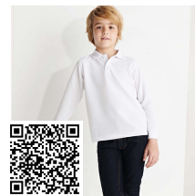
CARPE CHILD PO5008